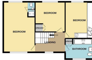
1ST FLOOR 708 sq.ft. (65.8 sq.m.) approx.