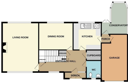
GROUND FLOOR 1084 sq.ft. (100.7 sq.m.) approx.